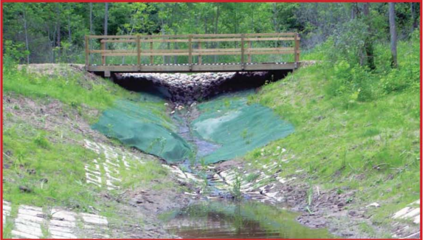
Reinforcement installed at channel crossing.

assisted in selecting plants that represent native vegetation for the area and also stabilize erosion. The Conservancy enlisted the help of volunteers and Wild Ones – Midland Chapter to plant over 1,000 plugs. Plants included native grasses such as big and little bluestem, blue flag iris and other wildflowers.