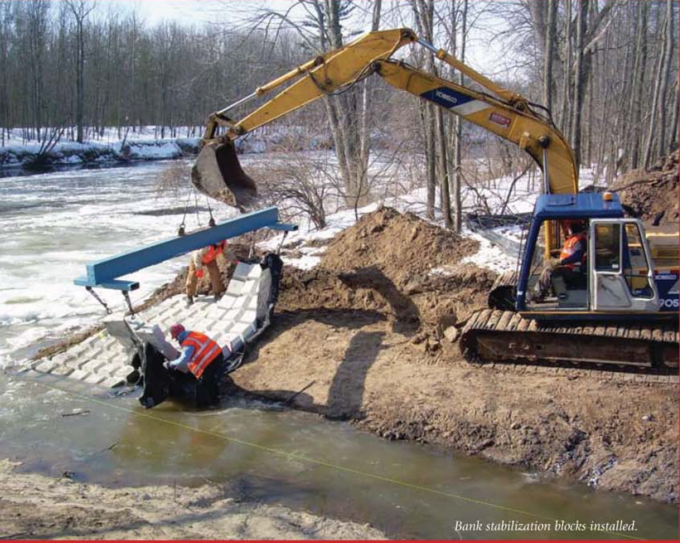
Bank stabilization blocks installed.

By Elan Lipschitz, Land Protection Specialist, Little Forks Conservancy