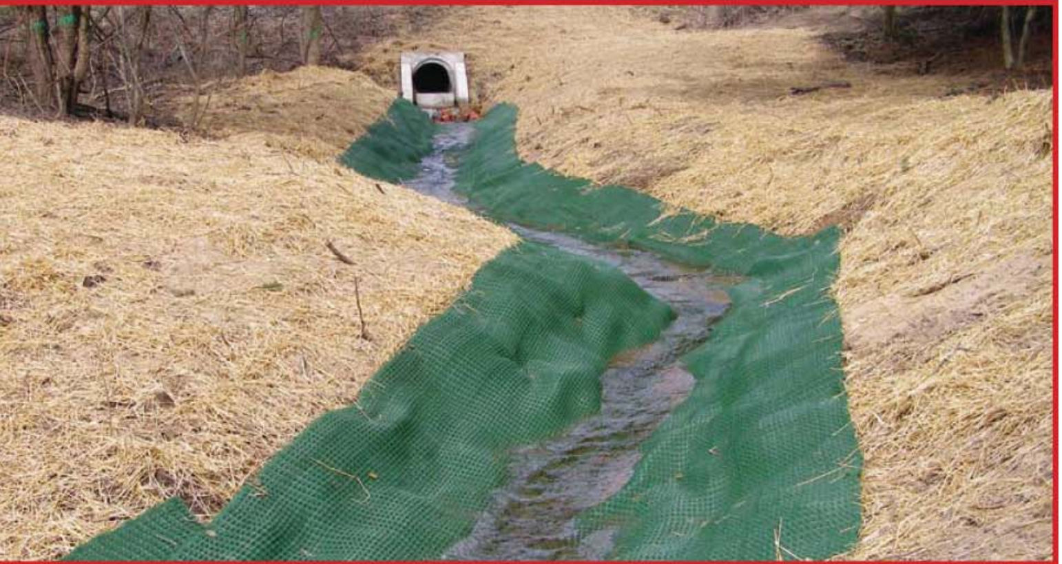
Turf reinforcing mats line the L&B Drain channel.