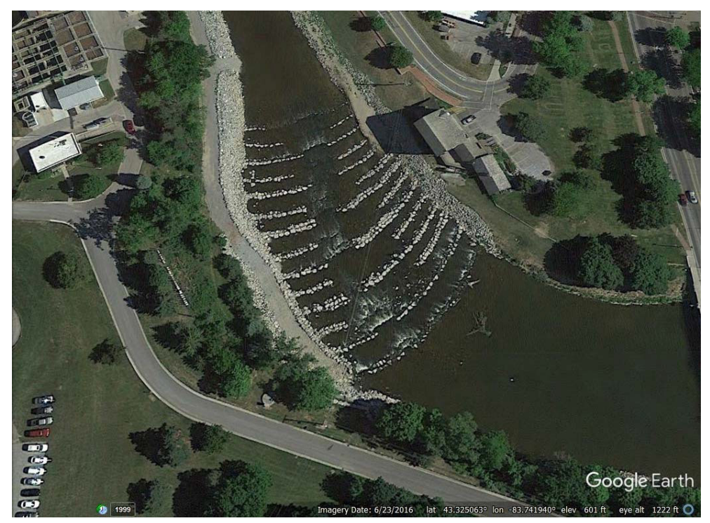
Figure 2. Aerial view of the Frankenmuth rock ramp completed in October 2015 in Frankenmuth, MI.