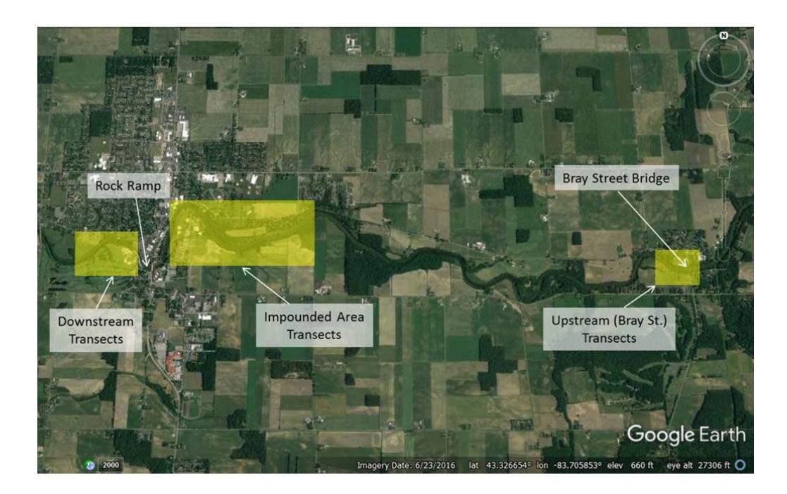
Figure 3. Location of Frankenmuth rock ramp, Bray Street Bridge, and general description of electrofishing locations downstream of the rock ramp, in the impounded area, and upstream sites near the Bray Street Bridge. Yellow rectangles indicate general transect locations.